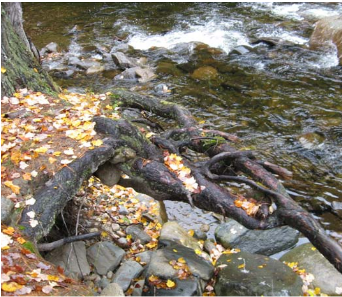
Over time, high water and an unstable river bank have left tree roots exposed.